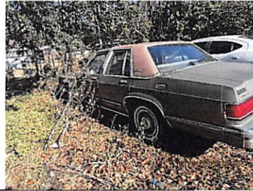
500 Hwy 15 Lot #20