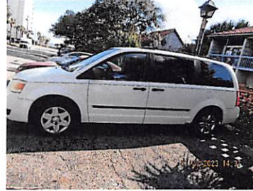
7003 N Ocean Blvd