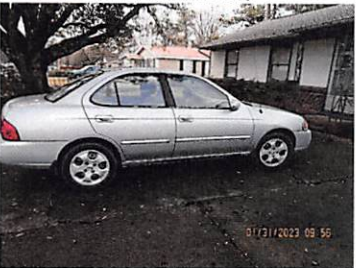
1021 Pine Dr.