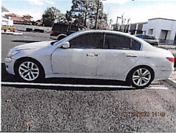
7904 N Kings Hwy