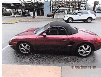
69 th Ave N beach Access