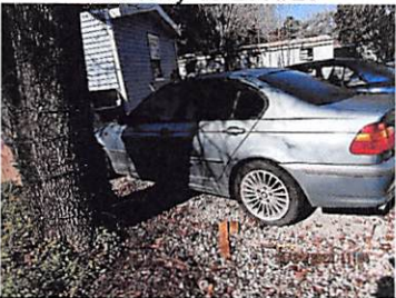
600 Hwy 15 Lot #20