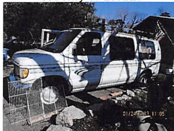
600 Hwy 15 Lot #20