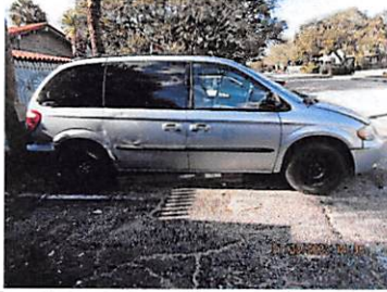
7003 N Ocean Blvd