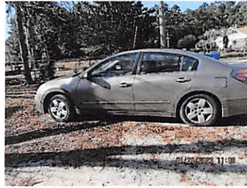
665 Martin St.