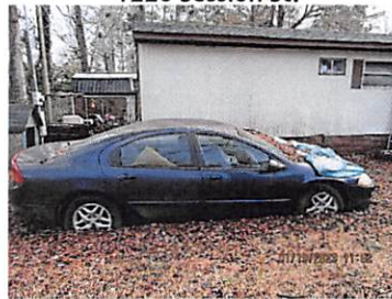
1226 Session St.