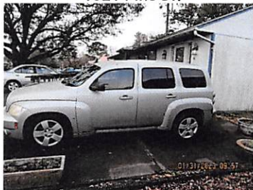
1021 Pine Dr.