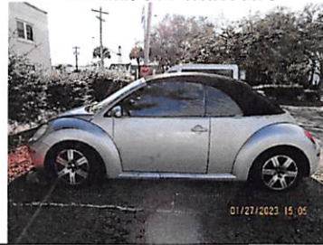
600 Mr. Joe White Ave