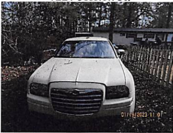
1221 Session St.