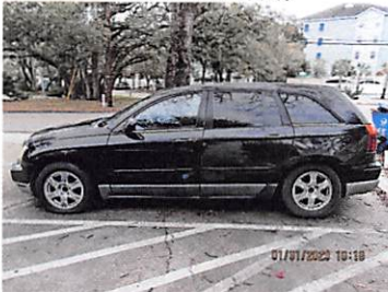
706 Mitchell Dr.