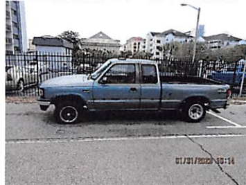
Mitchell Dr. & 7 th Ave S R.O.W