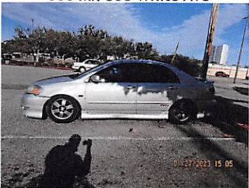
600 Mr. Joe White Ave