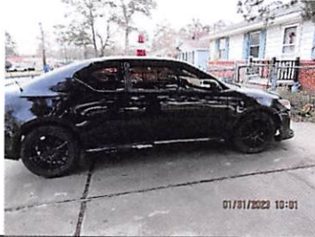
1057 Pine Dr.