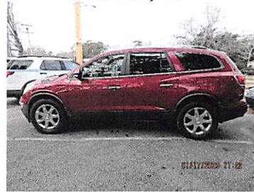
899 Hwy 15