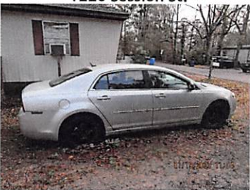
1226 Session St.