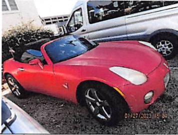
600 Mr. Joe White Ave