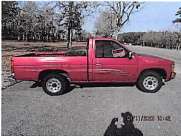
Nance St. R.O.W