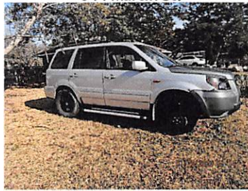
644 Martin St.