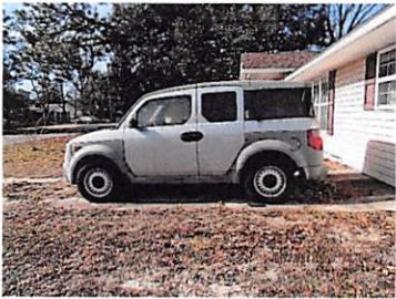
652 Martin St.