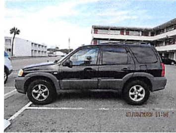
1404 S Ocean Blvd

THE CONSTRUCTION SERVICES DEPARTMENT, CODE ENFORCEMENT DIVISION HAS TAGGED THE FOLLOWING VEHICLES IN ACCORDANCE WITH ARTICLE 41, CHAPTER 5 TITLE 56 OF THE S.C. CODE OF LAWS. SEVEN DAYS HAVE ELAPSED SINCE TAGGING AND THE VEHICLES HAVE NOT BEEN REMOVED. THIS FORM IS FORWARDED TO THE POLICE DEPARTMENT FOR FURTHER ENFORCEMENT ACTION AND DISPOSITION.