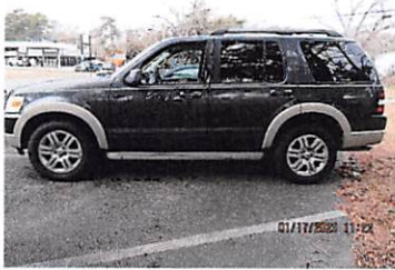
899 Hwy 15