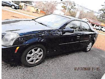
899 Hwy 15