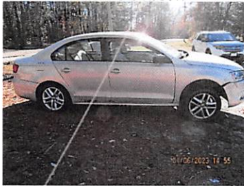
Nance St. R.O.W