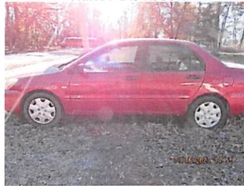
Nance St. R.O.W