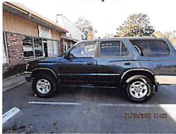
318 Hwy 15