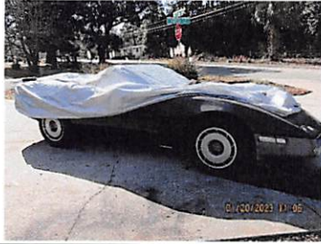
1148 Pine Island Rd